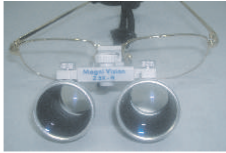
Metal frame (black, silver and gold colour)