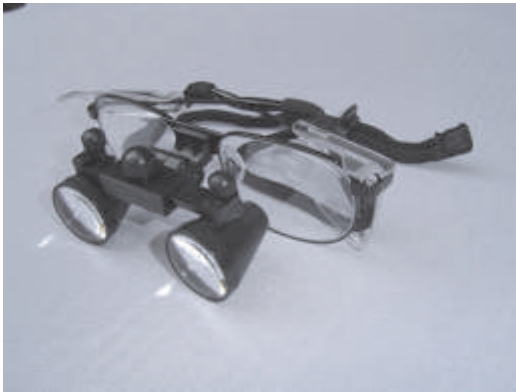
Compound Optical loupes

>>> Mainly Characteristic : The Pupillary distance can be adjusted by one center axis , it is very simply and convenience for user .