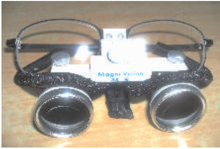
Titanium frame (black, silver and gold colour)