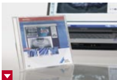
Image processing and archiving software Dürr DBSWIN 4