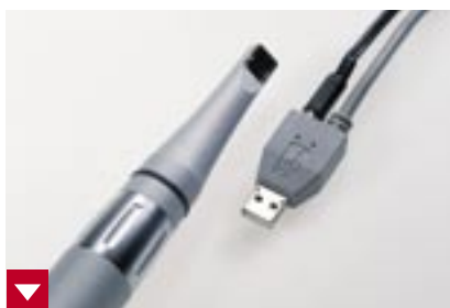
The power supply of the VistaCam Digital is ensured with a separate and direct power supply at the USB plug in accordance with MPG.