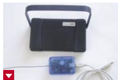
Optional: Foot pedal control set USB

Dürr Dental GmbH & Co. KG Höpfigheimer Strasse 17 D-74321 Bietigheim-Bissingen