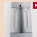
Adjustable metal ring enables a precise setting.